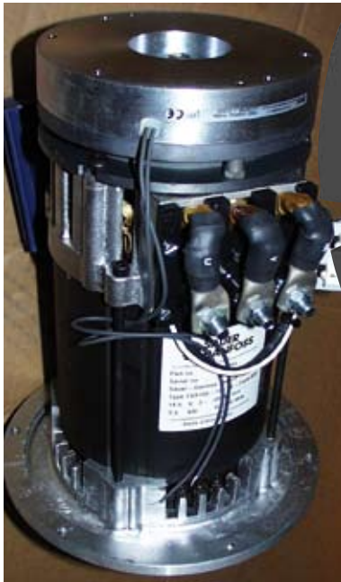
Warner Electric's PK60 electromagnetic brake mounted on an AC Sauer-Danfoss drive motor

brakes, Warner has chosen to focus on electromagnetic brakes for load wheel applications. The main advantages are: